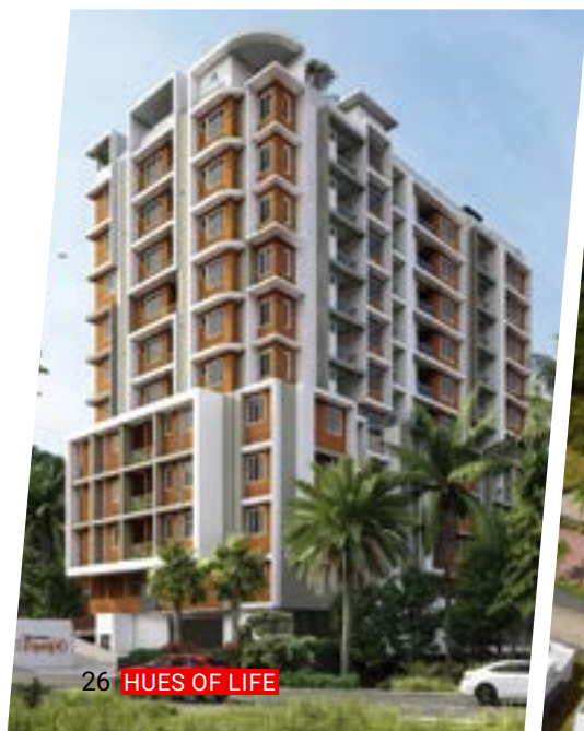
26 HUES OF LIFE